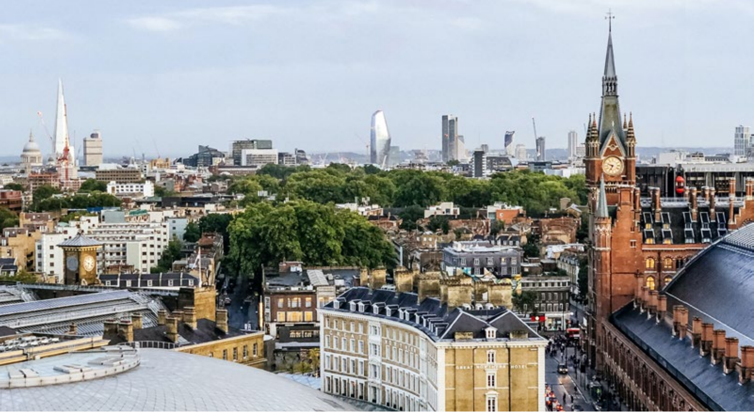
KING'S CROSS AND ST. PANCRAS INTERNATIONAL