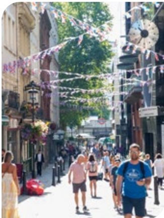
PEDESTRIAN-FRIENDLY VILLIERS STREET