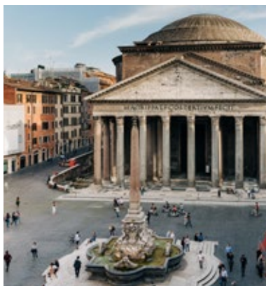
THE PANTHEON AT PIAZZA DELLA ROTONDA

Mix in underrated parks and greenways (Rome ranks #8 in our Outdoors category) and its thousands of portals back in time (Sights & Landmarks rank #3 in Europe) and it's easy to see how Rome remains an urban treasure.