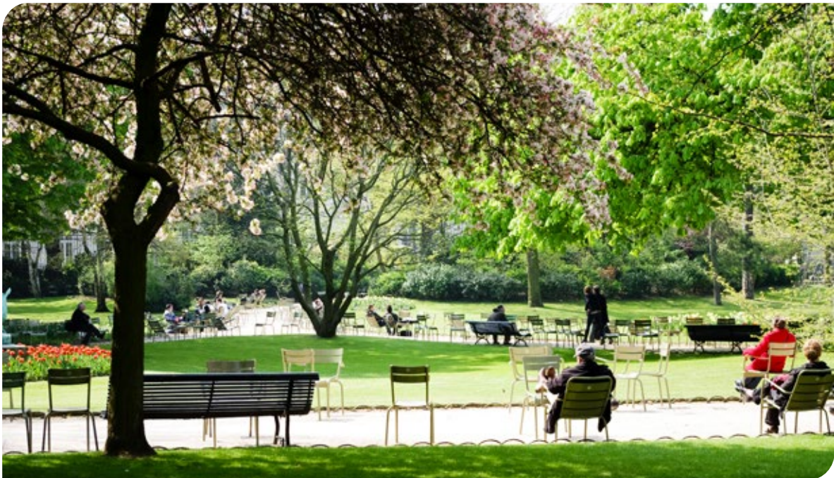
THE LUXEMBOURG GARDENS IN PARIS

No matter how they arrive, what Paris visitors new and returning find is a city that has codified pedestrianism and alfresco living.