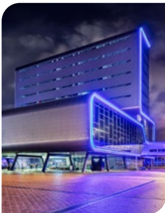
THE RAI CONVENTION CENTRE

The sometimes out-of-control nightlife (ranked #8 among European cities) that the city was known and often marketed for—despite the attendant human trafficking—was another opportunity to educate frustrated but powerless citizens, who were invited to workshops and given copies of a free book exploring the city’s role in the organisation and management of the global slave trade from a local perspective and what they could do to help the fight. And the city is fighting, going so far as to move the red-light district out of the famed De Wallen neighbourhood to the outskirts of Amsterdam while banning non-residents