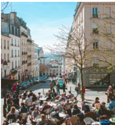
MONTMARTRE DISTRICT HAS LOST NONE OF ITS VILLAGE ATMOSPHERE

To ensure that cars didn't take back control of Paris streets as pandemic urban pilot projects waned—as was the case in many other cities—Mayor Hidalgo legislated that the 60,000 parking spots loaned to restaurants for outdoor seating simply remained as that outdoor seating. The same went for closing off lesser-driven streets entirely for public walking and seating for local businesses in need of additional outdoor space.