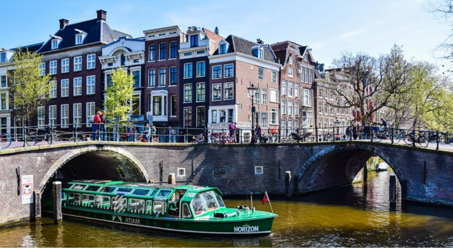
A SIGHTSEEING CRUISE ALONG THE CANAL