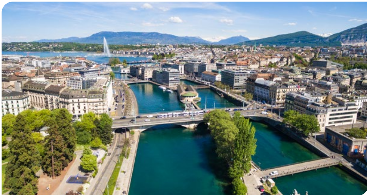
AERIAL VIEW OF THE RHONE RIVER IN GENEVA

Family tourism happens organically here, especially when you consider the handful of standout museums. The International Red Cross and Red Crescent Museum is a stirring journey of humanitarian work and the 150 years of the organisation, with three current exhibition spaces focused on defending human dignity, rebuilding family ties and limiting the risks of natural disasters. The Bodmer Foundation is the most unique book museum on the planet, and the Patek Philippe Museum is a loving, immersive ode to the centuries-old local craft of watchmaking. Back outside, and outside the city, several ski resorts beckon in winter, while local wineries are always ready for you. Don't miss Domaine Les Perrières, a family estate making wine since 1794.