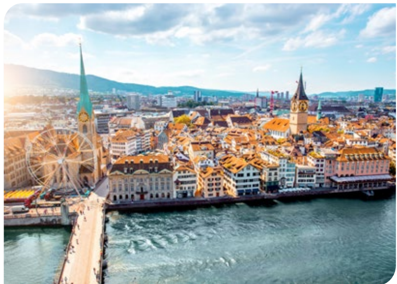
THE HISTORIC CITY CENTRE ALONG THE LIMMAT RIVER

New districts aside, summertime in the city is when Zürich truly comes alive, with everyone heading to the river or the lake's edge for picnics, swims and drinks. The coveted good life doesn't get more visceral than during these sweet moments.