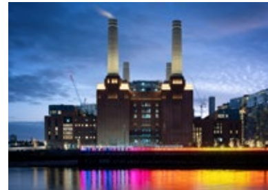
BATTERSEA POWER STATION SEEN FROM THE NORTH SIDE OF THE RIVER THAMES

If all those newcomers can't cook at home, they came to the right place, especially these days, when the culinary industry is being reborn after dozens of the city's most iconic restaurants shuttered over the pandemic. The city with the #1-ranked restaurants in Europe is buzzing again with big-name openings like Dubai-based izakaya-style restaurant Kinoya in Harrods.