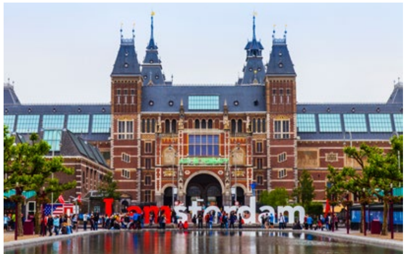
THE RIJKSMUSEUM IS DEDICATED TO DUTCH ARTS AND HISTORY

Buildout will feature 10 new apartment blocks, local amenities and even an elementary school. More than 2,100 residents are projected to live in the 700 new apartments, 80% of which will be offered as affordable or public housing at below-market rents and prioritised for citizens who have called the area home for six years or more.