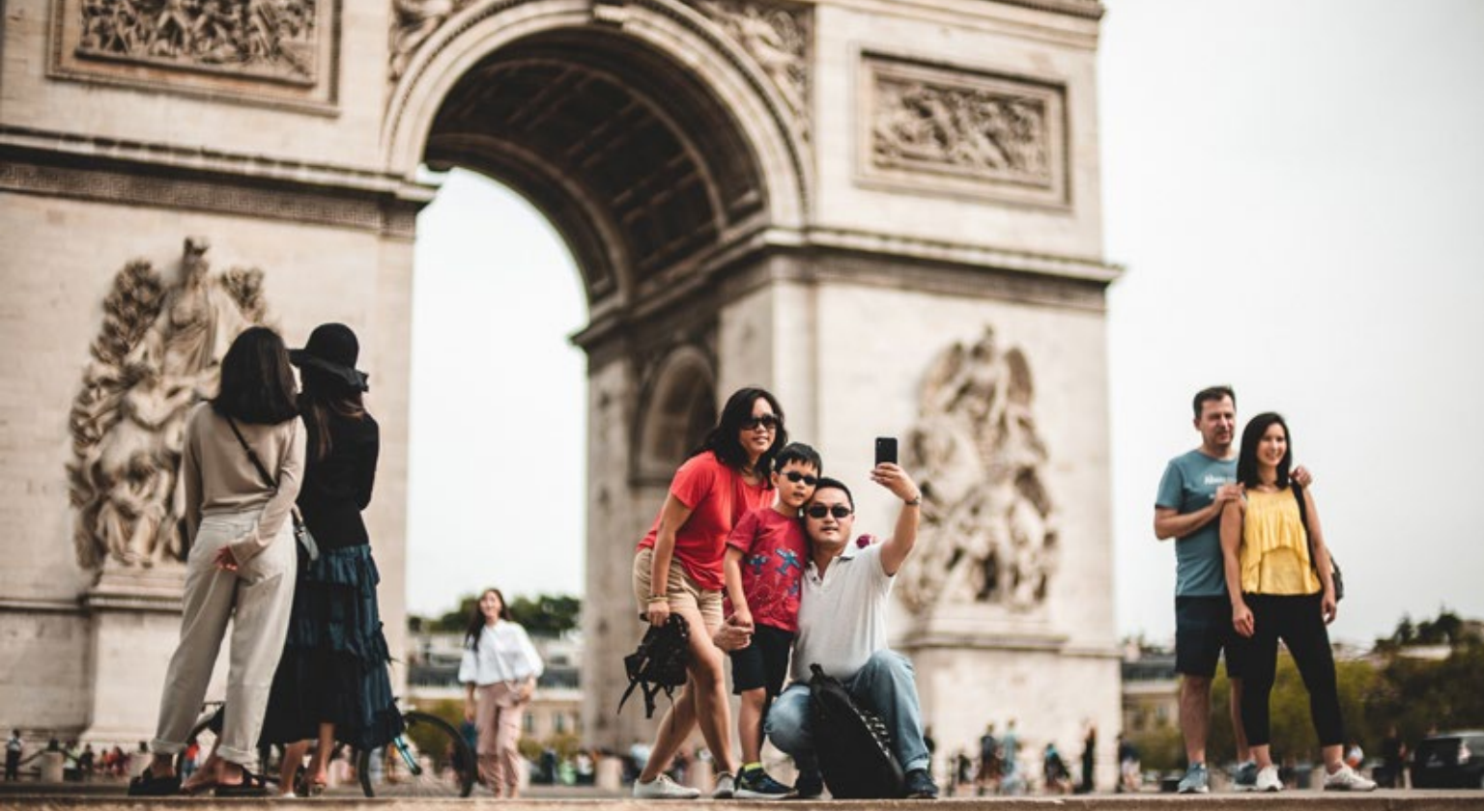
FAMILY SELFIE TIME IN FRONT OF THE ARC DE TRIOMPHE DE L'ÉTOILE