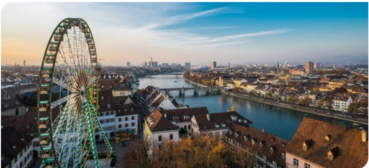
ONE OF EUROPE’S LARGEST FERRIS WHEELS IS LOCATED IN OLD TOWN

Future bioscience and tech investment will improve the city’s already impressive #9 spot for Fortune Global 500 companies that call it home.