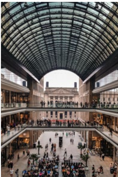
INSIDE THE BERLIN MALL

Berlin is a city where remnants of a fragile history mingle with a present in which being whatever you want simply comes with residency. These days, the city is welcoming waves of Ukrainians fleeing Russia's invasion, just like it has for decades—with mixed success—for newcomers seeking a new life from all over the world. It's a big reason why the city ranks #16 in our People category, including #15 in the Educational Attainment subcategory. Its #36 ranking for Foreign-Born Residents will climb as more immigrants seeking a better life arrive in the coming months and years.