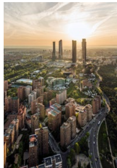
AERIAL VIEW OF THE CITY AT SUNRISE

confidently telling its story these days, ranking #6 in our important Promotion category (one spot behind its party girl sibling), including #4 for Google Trends and #5 for Tripadvisor Reviews. Where it pulls ahead slightly is appeal to investors, in which it ranks #5 in CBRE's 2023 European Investor Intentions report. (Barcelona ties Lisbon for sixth place.)